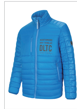
Men's Down Jacket