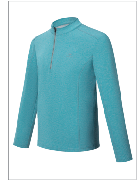
Men's Zip Top