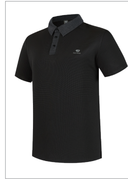
Men's Polo T-shirt