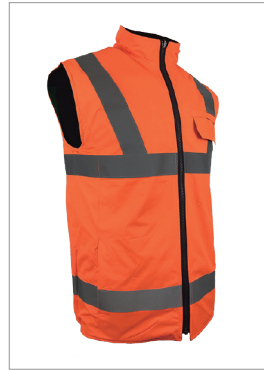
HIV Reversible Vest