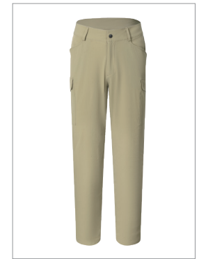
Men's Cargo Pant