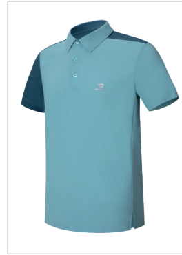
Men's Polo T-shirt