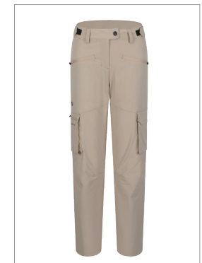
Women's Quick Dry Travel Pants