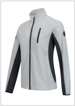
Women's Windbreaker Jacket