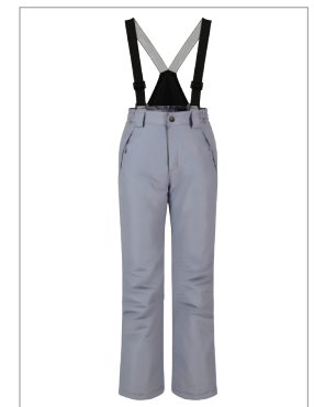
Kids' Ski Pants