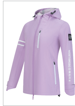
Women's Hiking Jacket