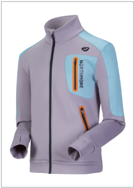
Men's Fleece Jacket