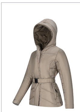
Women's Down Jacket