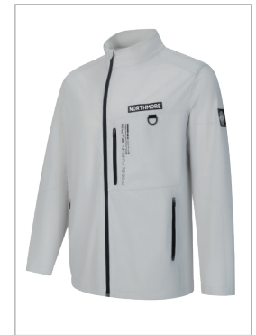
Men's Windbreaker Jacket