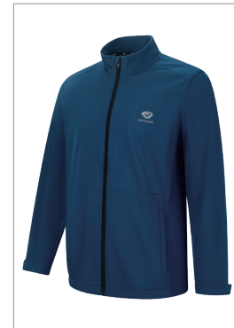
Men's Golf Jacket