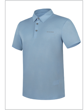
Men's Polo T-shirt