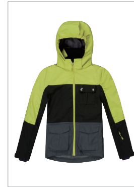
Kids' Ski Jacket