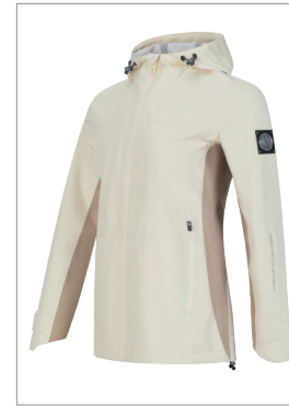
Women's Hiking Jacket