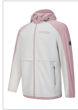
Men's Windbreaker Jacket