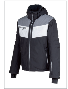
Men's Ski Jacket