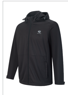
Men's Golf Jacket