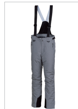
Men's Ski Pants