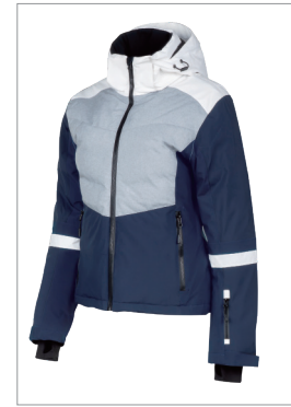
Women's Ski Jacket