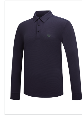
Men's Polo T-shirt