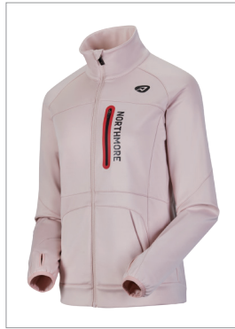
Women's Fleece Jacket