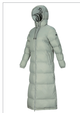
Women's Puffy Coat