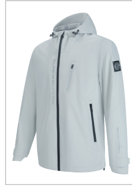
Men's Hiking Jacket