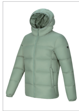
Men's Down Jacket