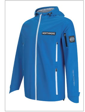
Men's Hiking Jacket