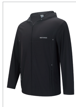
Men's Sunscreen Skin Clothes