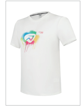
Men's Quick Dry T-shirt