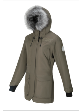
Women's Expedition Parka