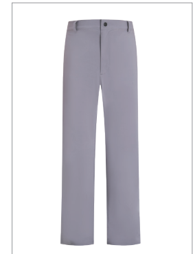
Men's Golf Pants