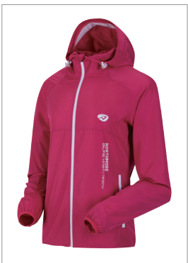
Women's Sunscreen Skin Clothes