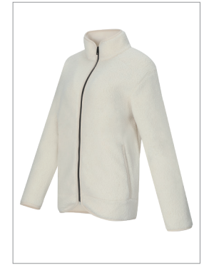
Women's Sherpa Fleece Jacket