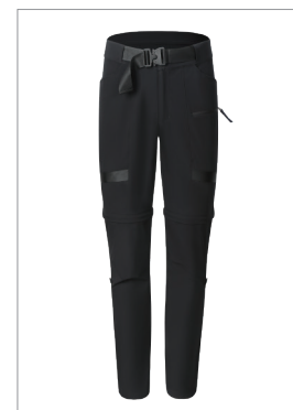
Men's Zip Off Pants