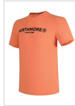
Women's Quick Dry T-shirt