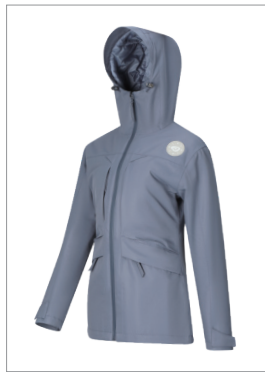
Women's Activeshell Padded Jacket