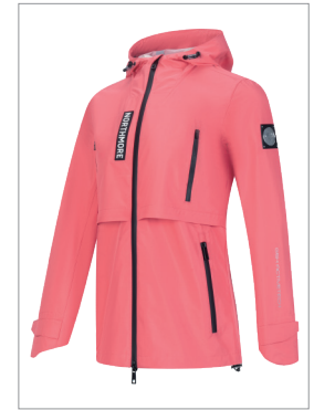
Women's Hiking Jacket