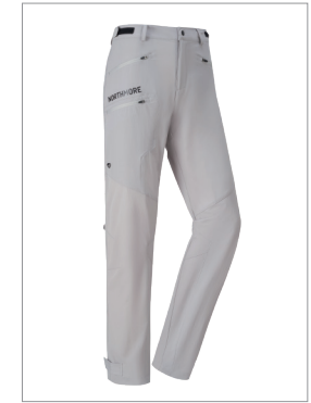
Women's Quick Dry Travel Pants