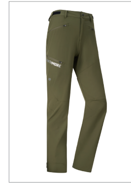
Men's Quick Dry Travel Pants