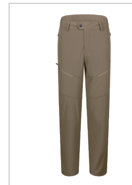
Men's Quick Dry Travel Pants