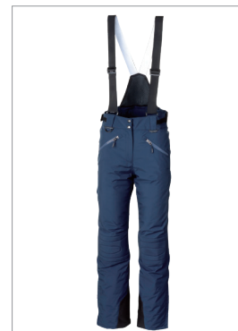
Women's Ski Pants