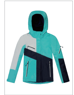
Kids' Ski Jacket