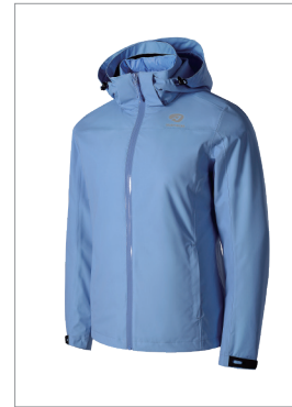
Women's Ski Jacket