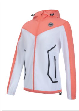
Women's Windbreaker Jacket