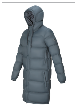
Men's Puffy Coat