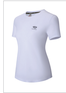
Women's Quick Dry T-shirt