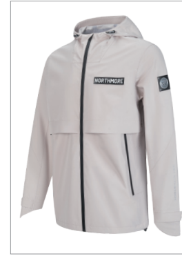
Men's Hiking Jacket