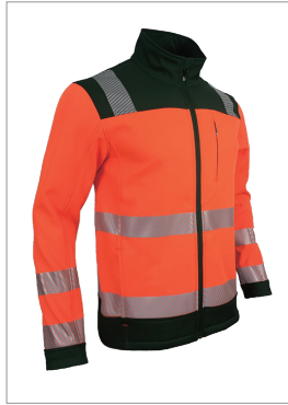
HIV Rain Jacket