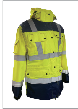
HIV Rain Jacket