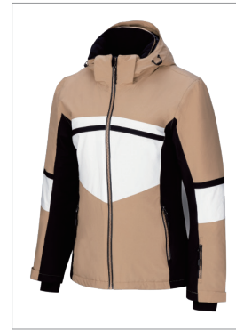
Men's Ski Jacket