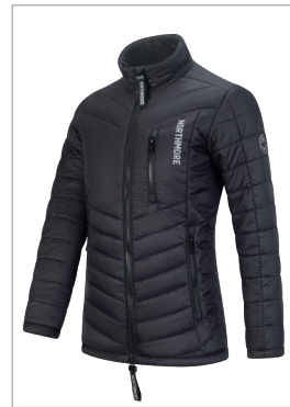
Women's Down Jacket