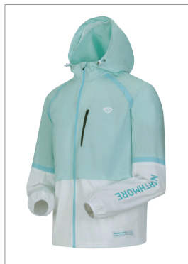
Men's Sunscreen Skin Clothes