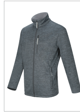
Men's Wool Fleece Jacket