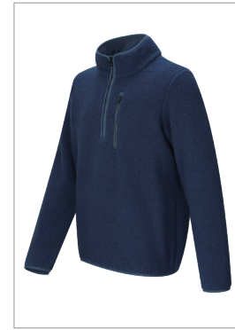
Men's Sherpa Fleece Jacket