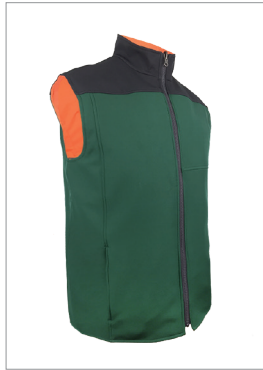
HIV Reversible Vest