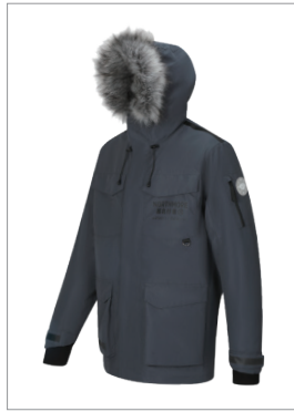
Men's Expedition Parka