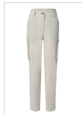
Women's Cargo Pant