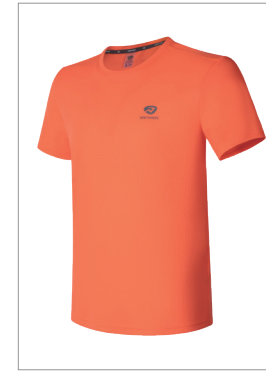
Men's Quick Dry T-shirt