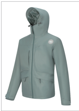
Men's Activeshell Padded Jacket