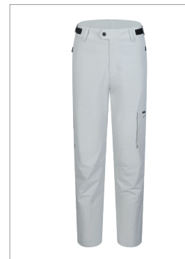
Men's Quick Dry Travel Pants