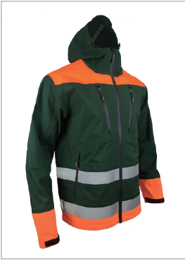
HIV Rain Jacket